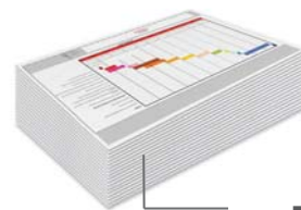
7,700 Sheets on-line